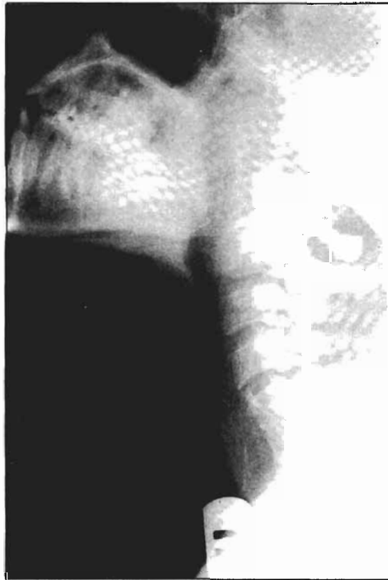
FIG. 1. An X-ray of soft tissue neck (lateral view) showing hypertrophy of adenoid causing narrowing of the air column.